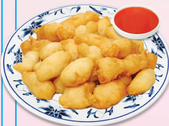
Sweet & Sour Chicken