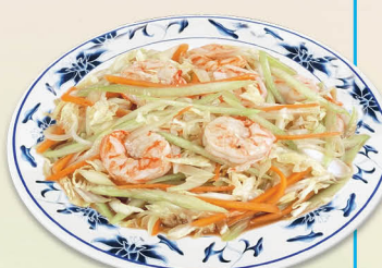
Shrimp Chow Mein