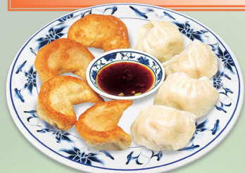
Steamed or Fried Dumplings