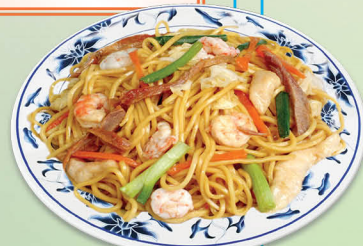
House Special Lo Mein