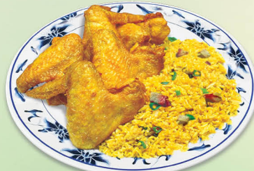
Chicken Wings w. Pork Fried Rice